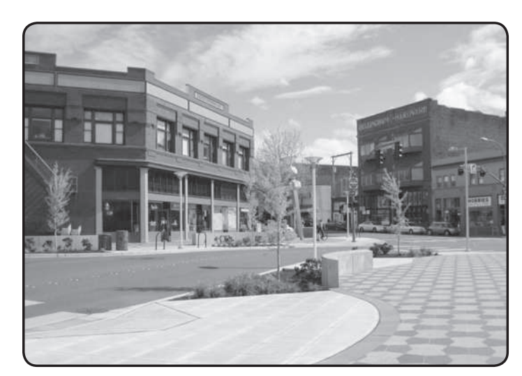
Bellingham, Washington

ticular school who would have a higher likelihood of mobilizing an on the ground effort. A Democracy School is scheduled for February 25 & 26 in Spokane. In addition the folks of Envision Spokane have made the decision to qualify a Community Bill of Rights for the November 2011 ballot. These amendments to Spokane's home rule charter would look to expand resident decision making rights on the neighborhood level, greater protections for the river and aquifer, constitutional rights