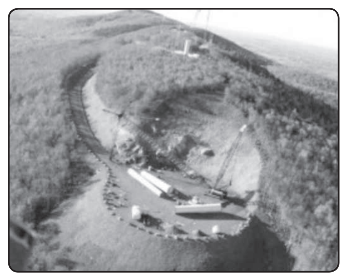
Wind turbine construction site Mars Hill, ME

Despite being billed as green energy, these turbines have devastating effects on nearby natural and human communities. What's more,