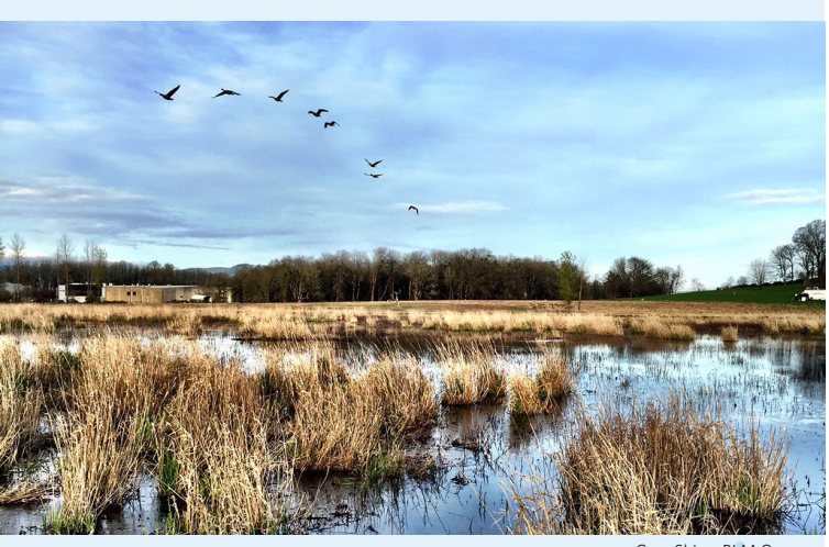
Living in right relationship with wetlands -Lane County, Oregon

CELDF's End-of-Year Newsletter is a highlight of 2024 and a sneak peek at our plans for the future. So enjoy the articles, factoids, features, and spotlights of the people who make CELDF the powerhouse that it is. We hope this CELDF snapshot helps you hold close and value even more what it means to be living in nature.