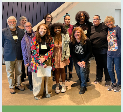
Making connections at the TRRR gathering in Cleveland